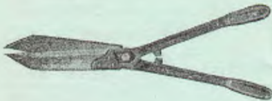
Wiss Hedge Shears