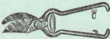
Wiss Pruning Shears