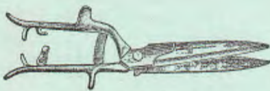
Wiss Grass Shears