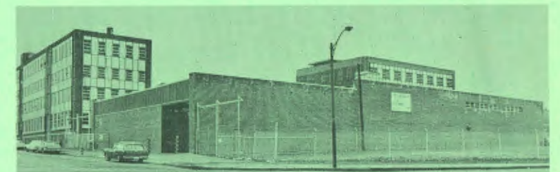
STAGE ONE: It was just about a year ago that Building A (steel warehouse) and Building B (tool and die shop) were erected as the first stage of our expansion and modernization program. At the same time an attractive metal facade and new windows were added to the main building.