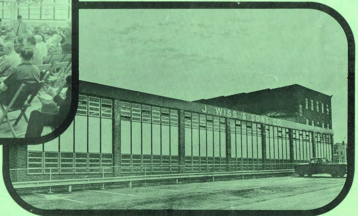
ALL DRESSED UP AND READY TO GO

LOCAL NEWSPAPERS ANNOUNCED THE EVENT WITH CLIPS LIKE THE ABOVE