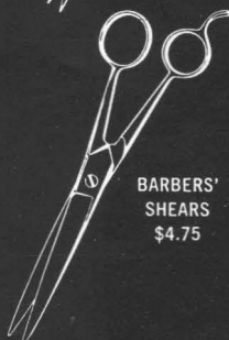
BARBERS' SHEARS $4.75