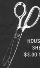
HOUSEHOLD SHEARS $3.00 to $5.50