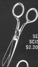
SEWING SCISSORS $2.20 to $3.25

Their professional-type bent handles guarantee ef- fortless cutting of clothes, slipcovers, curtains or draperies, $3.00 to $7.50